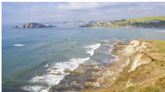
Looking towards Bigbury with Burgh Island in the distance