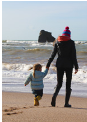
Walking on Thurlestone Sands